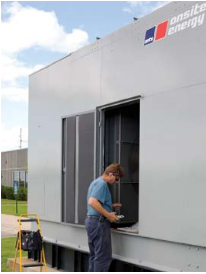
Figure 3. Regular exercise and maintenance of the complete power system are very important factors in high reliability.